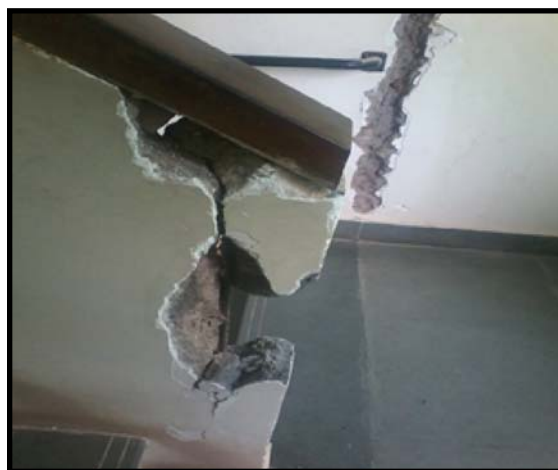
Pic: Walls of the college walls after drilling

Amidst all the hustle and bustle of the new academic year, our college has some renovation work going on. A lot of students, not only the First Years', have no clue about why there is 'sudden construction work' going on. The walls of the corridor, staircases are being drilled and repaired during the College hours leading to disturbances to the ongoing classes due to noise of drill