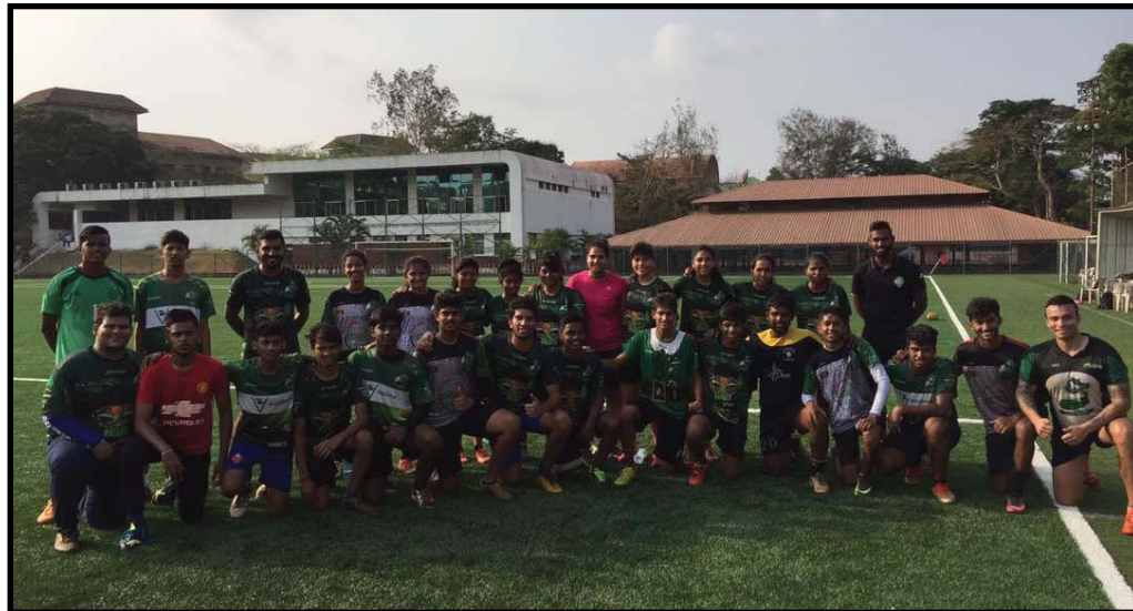
Pic: The Team poses

They've been showing their massive devotion towards the game ever since they started out as the CrocoTRYles .